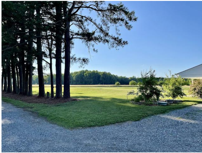
Looking at this photo, who would believe we were having severe thunderstorms just two hours earlier?

Photos from the picnic at Grapewood Farm