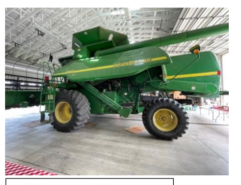
If you've never seen a combine up close, it is MAMMOTH!